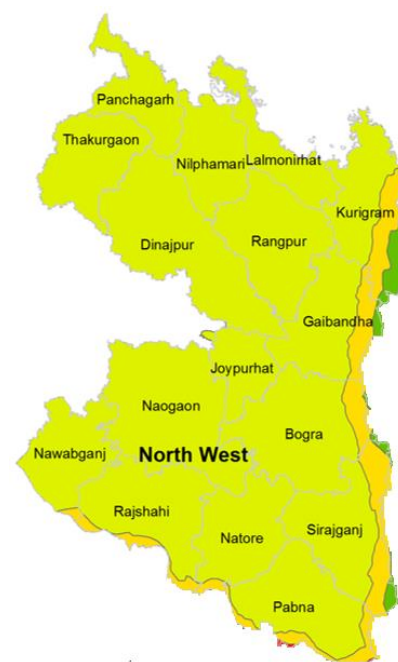
Figure 3 Northwest districts (shading indicates different hydrological zones)

groundwater use of changes to crop area and changes to other factors such as rainfall.