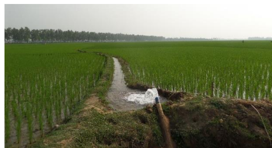
Figure 1 Irrigating Boro rice from groundwater in northwest Bangladesh

The project aims to define the sustainable level of water (particularly groundwater) use for irrigation and their impacts on the socio-economy and livelihood of the farmers including women in the northwest region of Bangladesh.