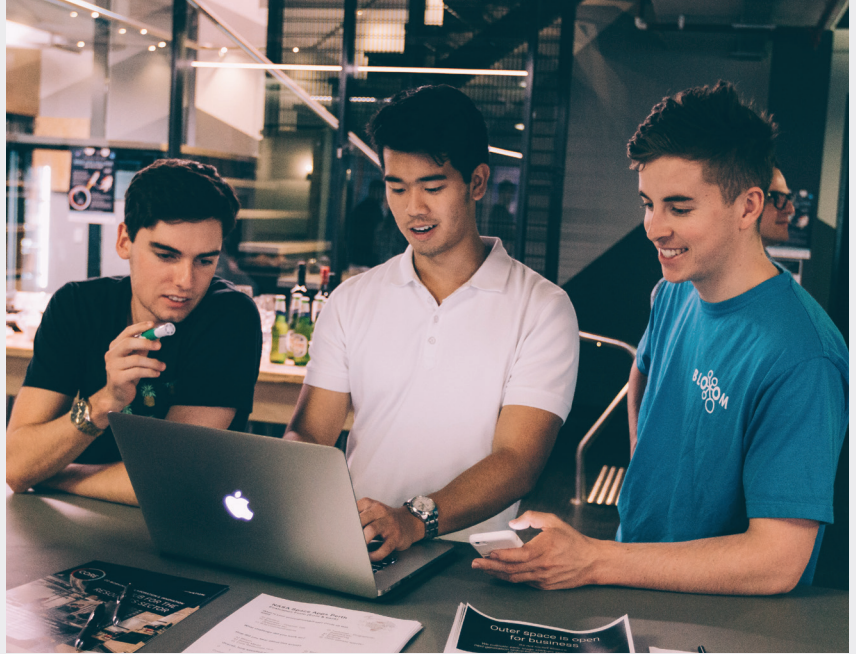
Learning new skills at an event run by CORE Innovation Hub