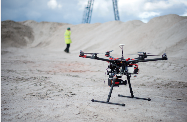
Hovermap (top) flies autonomously to map underground mine stopes, collecting data that's translated into images (below)