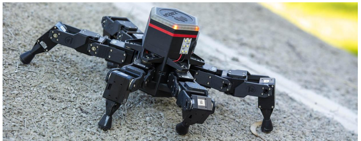
Data61's hexapod, Gizmo, draws inspiration from nature and can be used to inspect confined spaces.