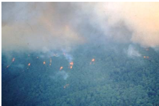
Figure 1. Multiple spotfires occurring on the left flank of the Mt Hickey fire, February 8 1982.

The process of spotfire ignition and development, or spotting, is an inherent part of bushfire behaviour in Australia. It is a major contributor to the loss of control of fires, the hazard faced by firefighters, and damage to the built environment. Due to its complexity, it is a poorly understood phenomenon. The significance of spotting depends on the type and availability of firebrand material, the ease with which it can be lofted and transported, and the probability that it will ignite a fuel bed when it lands.