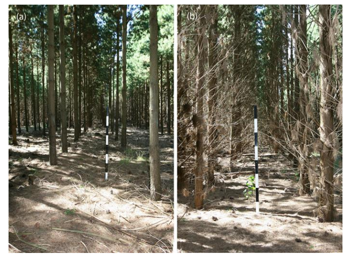
Figure 1. Understorey fuels in FMZ stand two years after T1 treatment (left) and a comparable untreated stand (right).

"Green Triangle" region of South Australia/Victoria. The prescription is defined by an initial low prune (P1) up to no less of 2.5 m when the stand has reached a mean tree height of 7.5 m and an age of 4 to 6 years. A second higher pruning (P2) to 6 m is conducted around the age of 7 to 9 years in high site quality stands. This pruning is followed by an early first thinning (T1; Fig. 1) that removes approximately 50% of the stock. After this first thinning, other silvicultural operations (e.g., a second (T2) or third thinning (T3)) coincide with operations in the rest of the compartment.