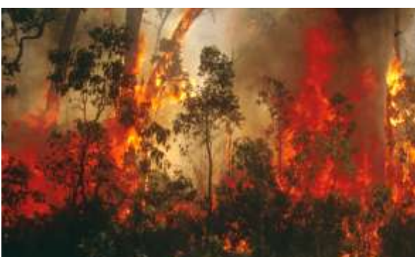
Figure 1. An experimental fire from Project Vesta burning in dry eucalypt forest typical of southern Australia.

To aid implementation of the DEFFM, a set of default fuel parameters for different fuel ages are presented