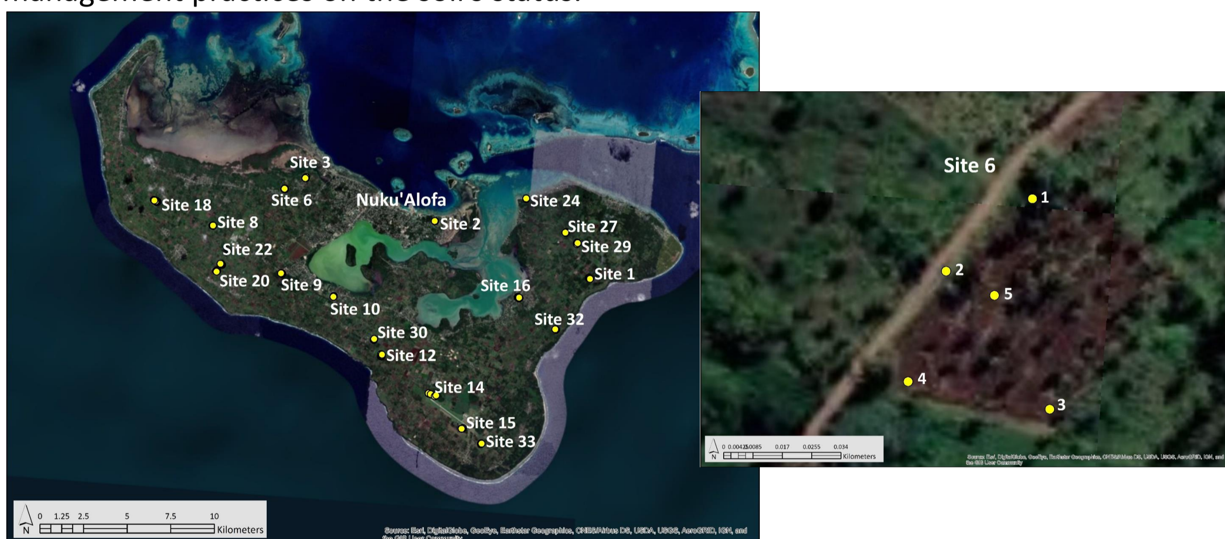
Figure 1: Sampling locations across agricultural plots on Tongatapu island, Tonga.

Sampling locations across Tongatapu island were chosen at agricultural sites with soil legacy information (Potter, 1986; Cowie et al., 1991) to also allow for comparison of the impact of management practices on the soil's status.