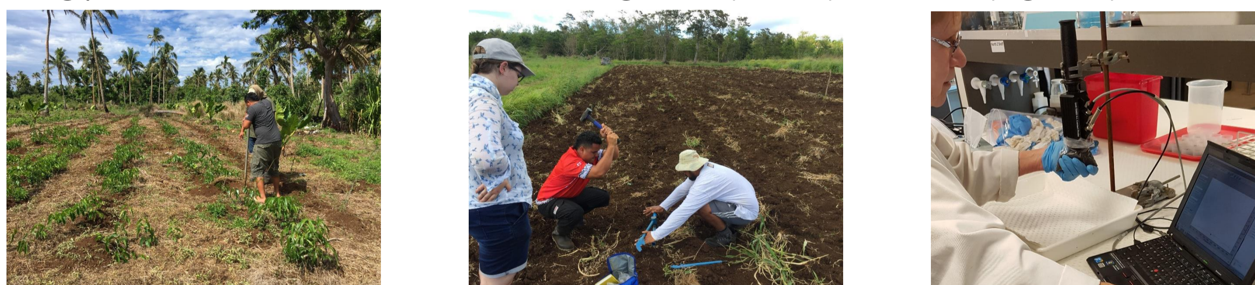
Figure 2: Soil sampling in the field, and spectral analysis using a Panalytical ASD LabSpec vis-NIR spectrometer.

Five soil core samples were taken from the corners and centre of 1 ha plots at each site using a hand-corer; representative of the top- and subsoil (i.e. 0-15, 15-30, and 30-60 cm) (Figure 1 and 2). The centre soil core of each plot was analysed for TC and SOC in the laboratory (81 samples) using the dry combustion method (Leco), whereas all 382 soil samples were scanned using portable vis-NIR; in field and air-dried ground (<2mm) condition (Figure 2).