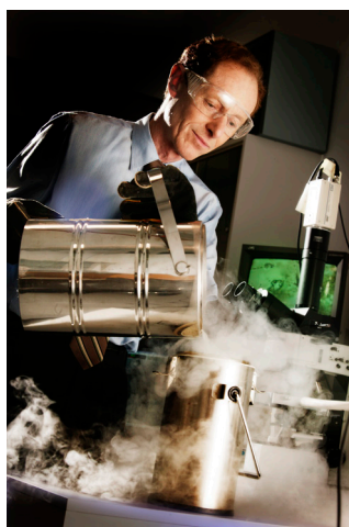
Preparing a sample for analysis in the fluid history analysis laboratory.

The research team works closely with both CSIRO's organic geochemistry team, that analyses the molecular composition of oil inclusions (MCI), and structural team, that investigates trap integrity, to provide a complete fluid history analysis capability.