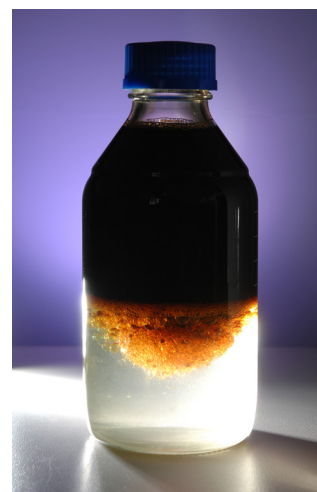
Crude oil from the Barrow oilfield, Western Australia.