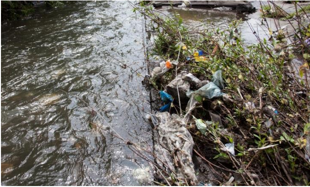
Debris transported by storm water lodged in the environment