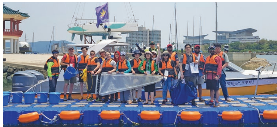
Capacity building in Korea with local NGO partners.

We are also identifying opportunities for improved waste management and valuing plastic to reduce poverty and create alternative livelihoods.