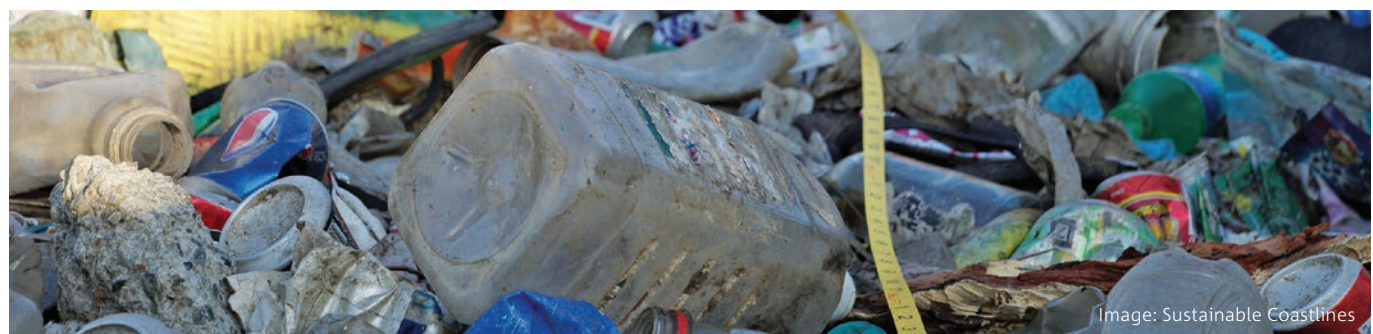
Image: Sustainable Coastlines

Please contact us if you're interested in participating.