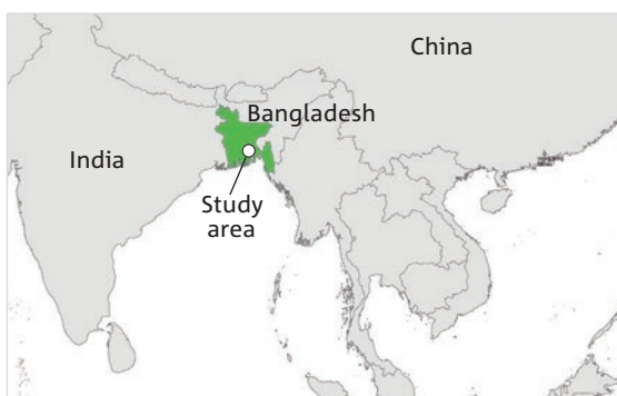
Chandpur, Bangladesh, one of our study sites.

We are developing a world-first empirical baseline estimate of mismanaged waste entering the marine environment. Results will be publicly available through visual products to increase awareness, inspire change, and transform the global conversation around plastic usage and its environmental impacts.