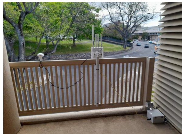
Data is retrieved via a nearby LoRa router.

Installation of the sensors is quick, simply requiring positioning above the asset's collection area. The sensors require little maintenance. In future deployments, snap-lock frames will be attached to grates from which a sensor can simply be exchanged for maintenance or an external QR code can be read for automatic registration of the sensor at a new location.