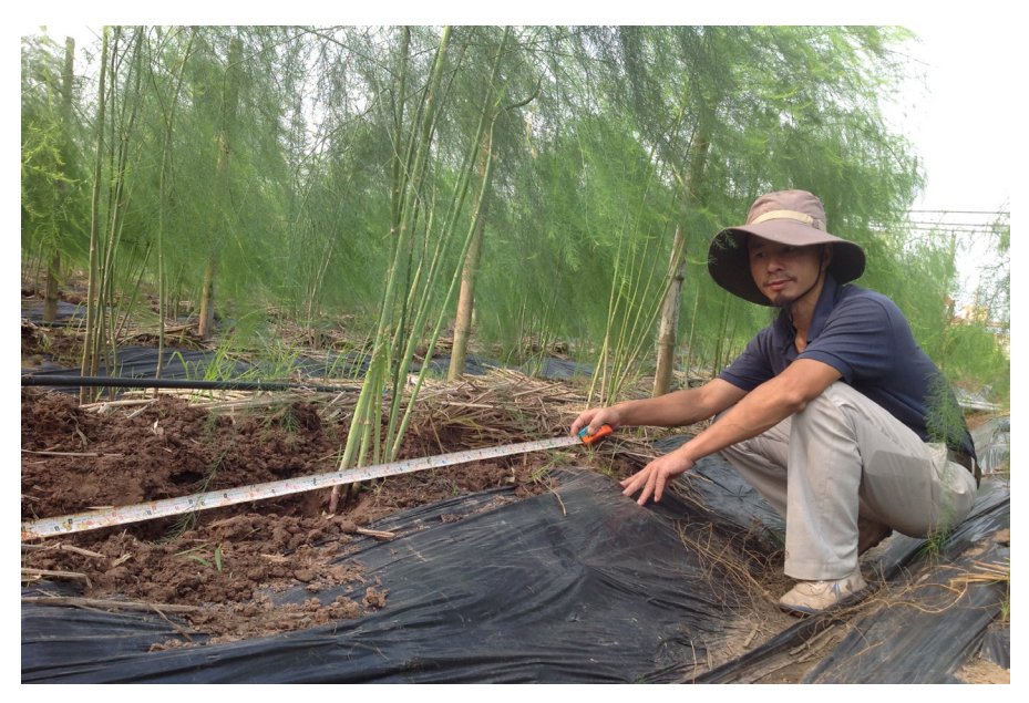
Nano fertiliser developed by Vietnam Academy of Science and Technology tested on asparagus. This project is one of seven pilots for science commercialisation approaches.

The experience and insights from the SCP program will be used to scale successes and systems to other research institutes beyond the program.