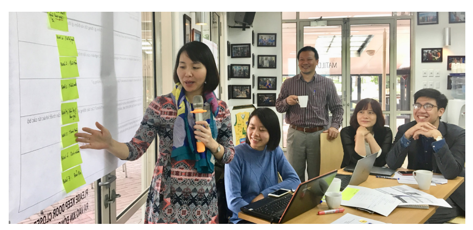
Researchers from universities and institutes in a training course.

Examples include training and mentoring in global best practice for commercialising agriculture and food technology for sustainable outcomes, and co-developed guidance for national and institutional policies.