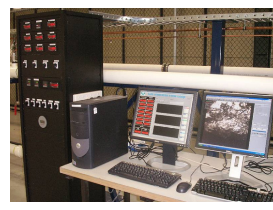
Data acquisition system.

The materials inside the pipe can be visually inspected and recorded by high speed video cameras through high pressure visualisation windows at three different locations on the test section.