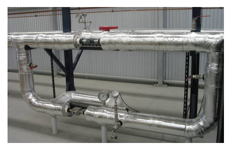
'U' bypass for shutdown/startup/hilly seabed simulations.

The loop is 20 m long by 3 m wide with a horizontal test section 40 m in length. The pipe is constructed from stainless steel with an external diameter of one inch. A 'U' by-pass deviation 2 m long and 1 m deep is used to simulate a low point along the pipeline.