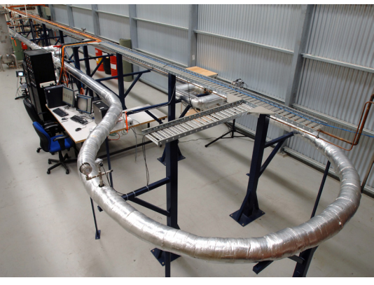
Layout of the hydrate flow loop.

CSIRO is delivering advanced knowledge of gas hydrate formation and evolution in gas-dominant flows, to improve the design and operation of offshore gas production pipelines.