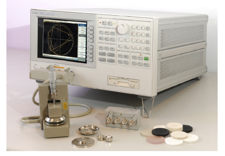
The parallel plate cell is used for thin discshaped samples in the range from 1 KHz to 10 MHz using an impedance analyser.

Parallel plate capacitance measurement is the most commonly recognised dielectric spectroscopy method and typically achieves its best performance from 1 KHz to 10 MHz with a large volume of investigation. The CSIRO Petrophysics Laboratory has developed a 3-terminal capacitor dielectric cell connected to an Agilent 4294A impedance analyser, to offer improved measurement over the common 2-terminal capacitor. The cell requires disc-shaped samples that are dimensionally stable with faces milled to be both smooth and parallel, to avoid the creation of an air gap. Parallel plate dielectric measurement is possible from 100 Hz to 100 MHz, however, the preferred range is limited to 1 KHz to 10 MHz.