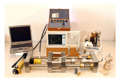
Overburden pressure dielectric analysis is achieved using the cell depicted above. The sample is loaded into the coaxial cell for dielectric analysis and a purpose-built loading rig is applied to simulate in-situ overburden pressure.

The large loaded coaxial transmission line cell has been designed to fit the standard 1.5 inch core sample and to be operated at overburden pressures of up to 35 MPa. The samples are cut from core and a hole is drilled through the centre. The apparatus can then be externally, axially loaded to achieve a plain strain condition and recreate effective overburden pressure. The cell is then attached to an Agilent E5070B network analyser and offers high precision measurement of dielectric properties from 1 MHz to 3 GHz.