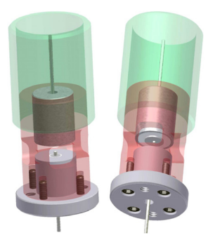
Drawings of the miniature parallel plate cell developed for small rock fragment samples.

characteristics of the rock to be more properly captured. The cell requires a large rock drilling fragment, machined to fit inside the cell, and is analysed with an Agilent 4294A impedance analyser.